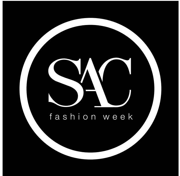
On Dark Background